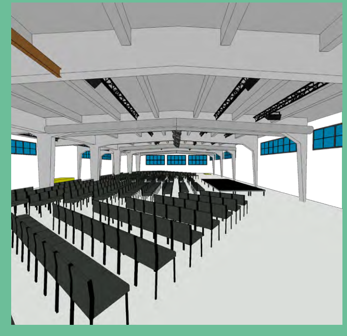
Seating side (view from Front Hall)