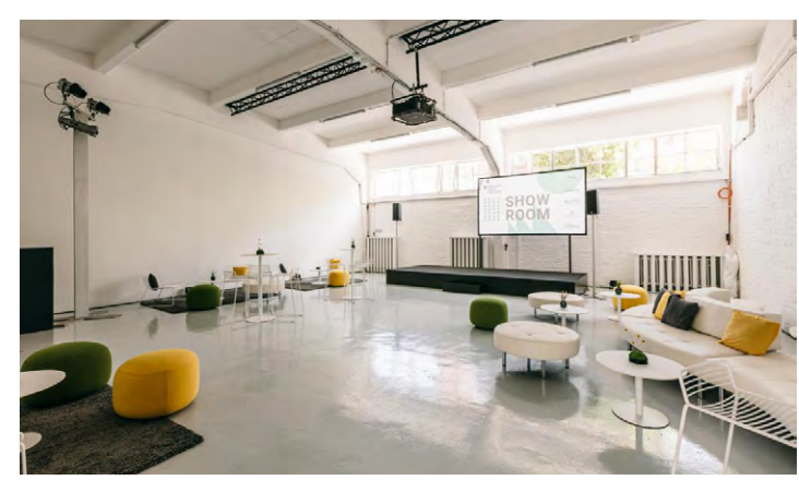
Main Hall Meeting 1

Additionaly to our already existing seating plans our preferred Partner Party Rent would be glad to create your own individual plan (hourly rate 75 € net).