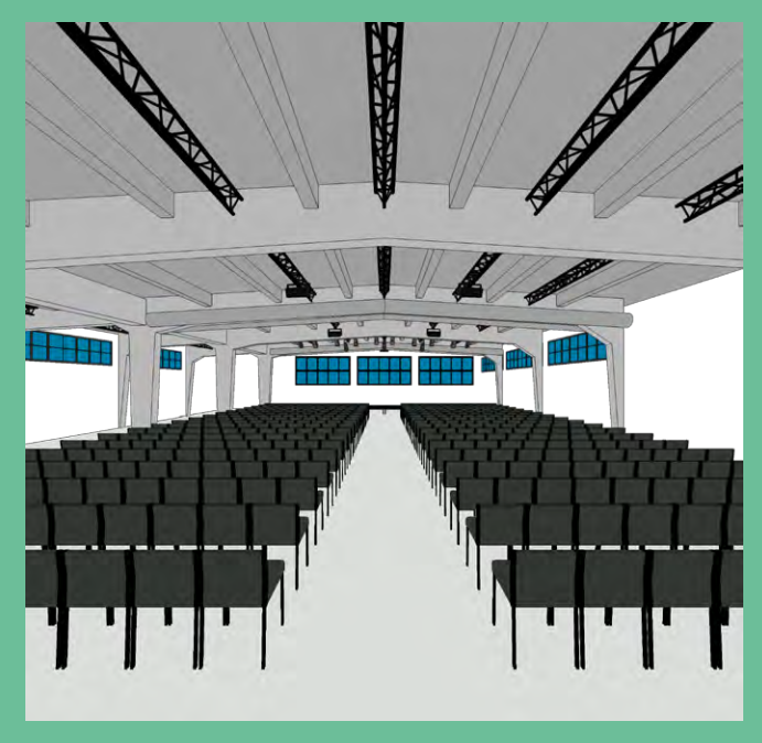
Seating ahead (view from Front Hall)